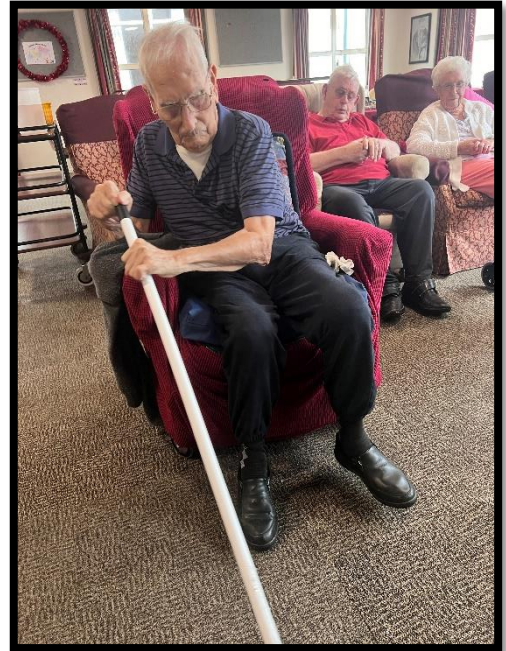
Indoor Broom Golf was enjoyed immensely.